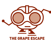
THE GRAPE ESCAPE